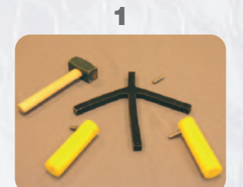
Setting of each element