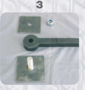
Welding of the fixing plate at the top of the screen frame